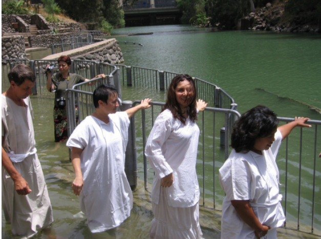
Going through the Baptism (Mikvah)

We have young believers among us who have come to us from the Homeless Outreach in Tel Aviv and have made the covenant with our LORD and Savior, the King and the Messiah of Israel. This covenant, as you know, is a blood covenant of our redemption paid by our Great King and Savior for us.