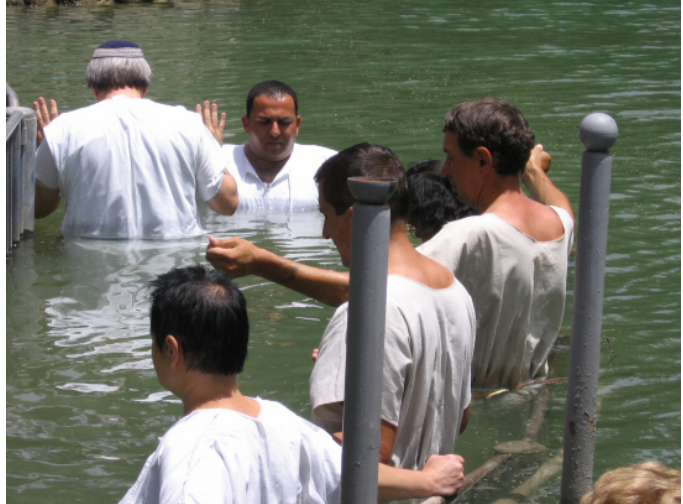
in the waters of Jordan.