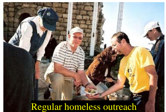
Regular homeless outreach

All our people with their families and children who were living in HLM's shelters in Tel-Aviv and were willing to move to the desert, came with us and moved to the agricultural area of the Northern Negev. It was a difficult but fruitful and an exciting year! "Thus far the Lord has helped us". 1 st Samuel 12b!