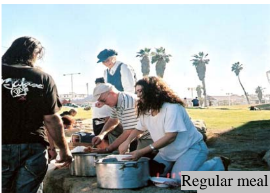
Regular meal distribution

Although we have moved, our commitment to the homeless outreach in Tel-Aviv continues. Every Shabbat we bring the food to the homeless and needy people of the area, thus seeking to manifest the practical faithful love of our Blessed Messiah. "Assuredly, I say to you, inasmuch as you did it to one of the least of these my brethren, you did it to me" Matthew 25:40.